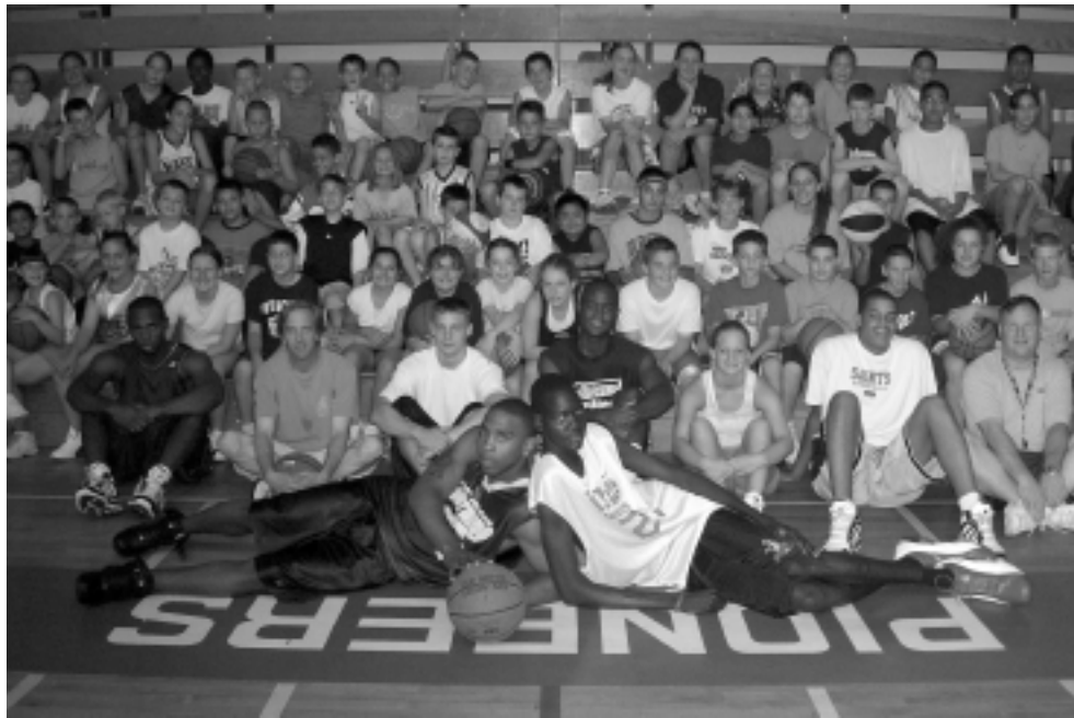
Our Savior Summer Basketball Camp, Centereach, NY